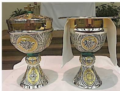
Diocesan Traveling Chalice and Ciborium. (see page 7.)